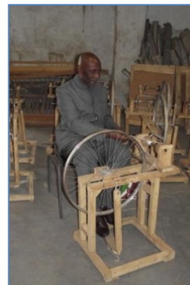
Some unique woven products