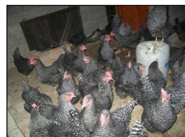
Chickens reared to feed the orphans